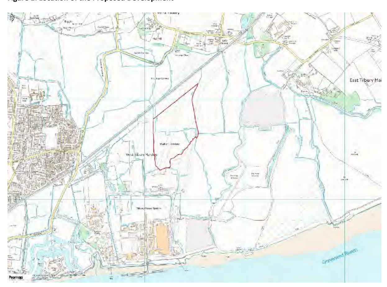
Figure 1: Location of the Proposed Development

This Statement of Community Consultation ('SoCC') is published in connection with a proposal for two Gas Fired Electricity Generating Stations (GFEGS) at 299.99MW each and a Battery Storage Facility (BSF) at 150MW to be known collectively as Thurrock Power Flexible Generation Plant ('the proposed development'). The proposed development would be located on land directly north of the existing National Grid Tilbury substation, approximately 900m to the south east of Tilbury, 1.2km south of West Tilbury, 2.2 km west of East Tilbury and 2.3 km to Chadwell St Mary (refer to Figure 1 ) in Thurrock. The proposed development is being promoted by Statera Energy (Thurrock Power) Limited ('Thurrock Power').