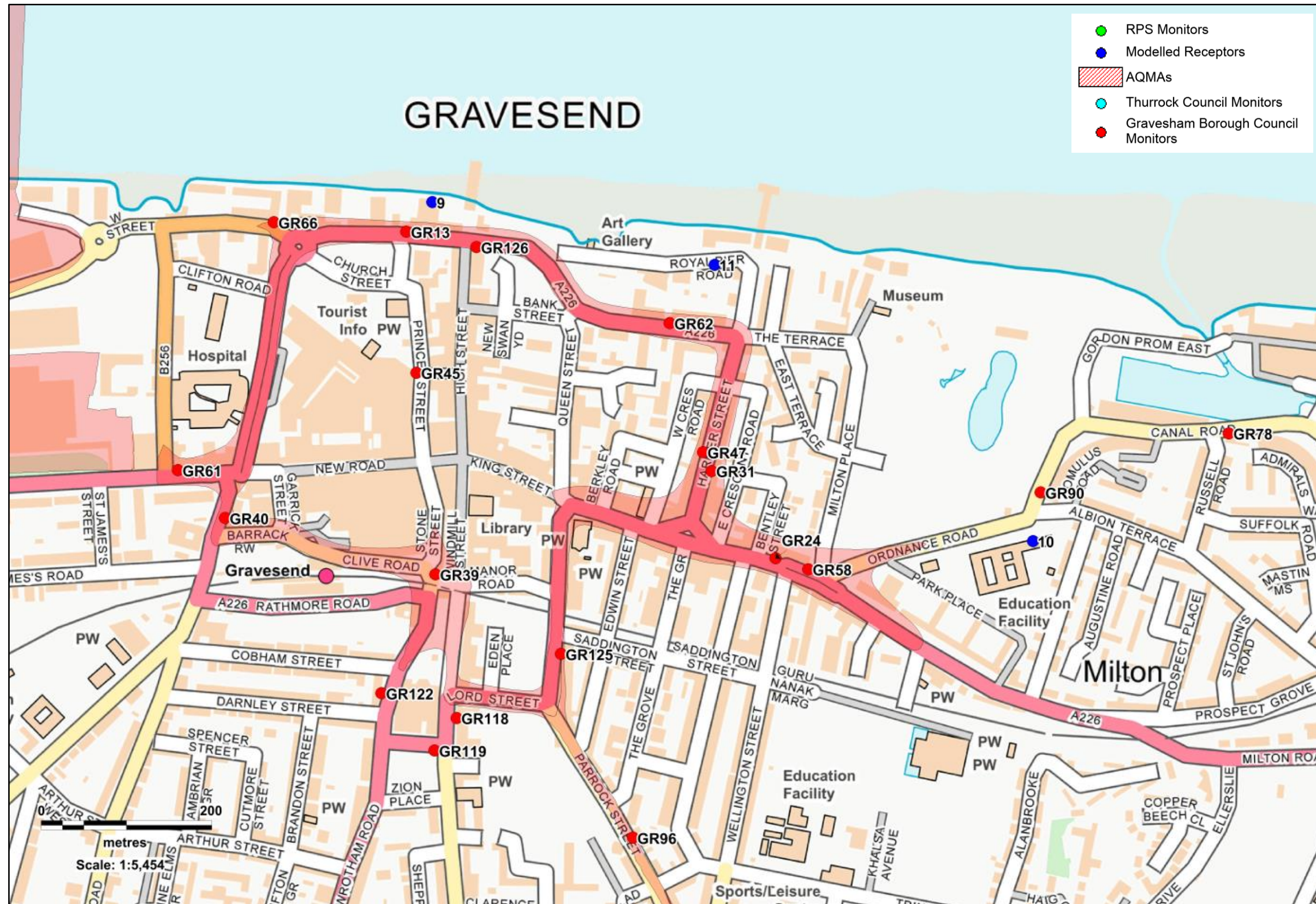
Figure 1.3: Modelled Receptors and Monitoring Locations – Gravesham