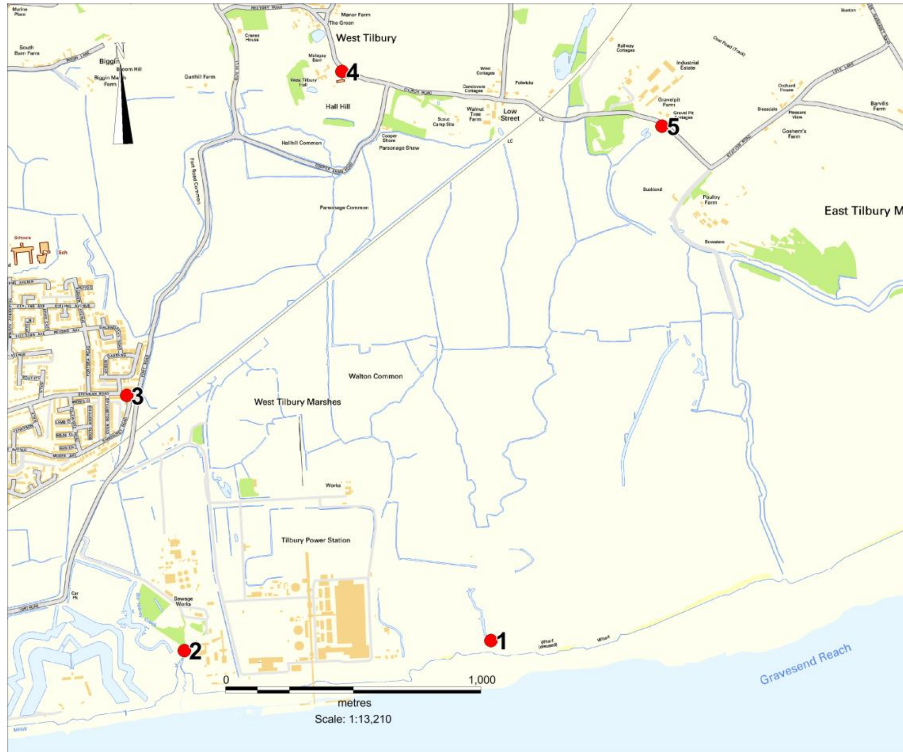
Figure A.1: Map of Monitoring Locations