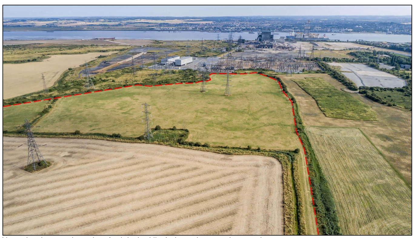
Note: development boundary (red dashed line) shown is approximate only Figure 3.2: Main development site baseline photograph – looking south towards Tilbury Substation